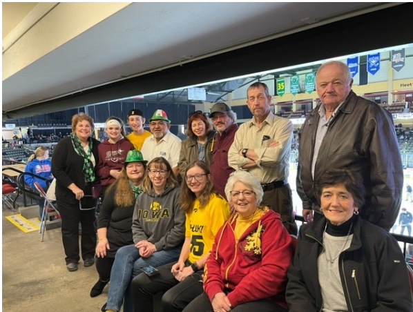
Church Hockey Outing—Muskies win!!